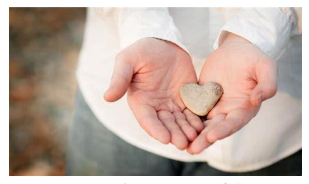
How does it work?