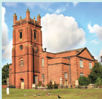
Brierley Hill Church