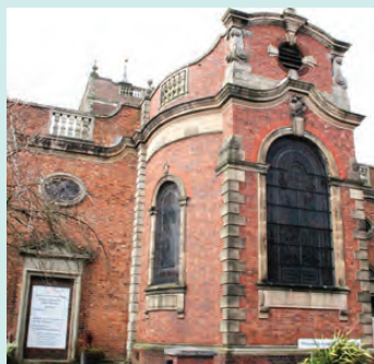
Stourbridge St Thomas