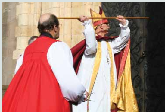
What opportunities lie behind the door?

I deal with baptism, wedding and funeral enquiries, preparation and services; chairing DCC and attending PCC and leading All Age Worship services once a month; the list is endless but I would not want anyone to think that I am doing it for personal praise, for I am simply doing what God has called me to do. Many folk have said they don't know how I cope with it all; the simple answer is that God has called me and is working through me.'